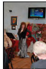
Sarah Bernhardt, the 8th wonder of the world.