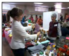
2015 Craft Fair