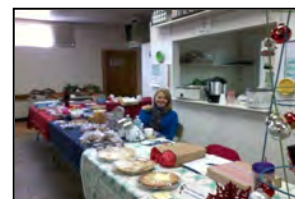
Craft Fair Bake Sale