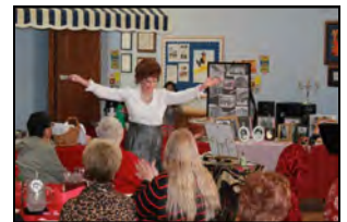
Lilly Langtree ~ "Kissing is a lot of fun but it doesn't pay the bills!"