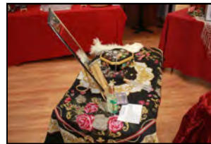
The lady's dressing table