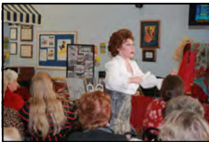
Lilly Langtree was a P.B. (professional beauty)