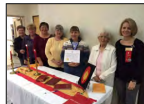
New Member Initiation