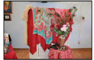
A ladies boudoir