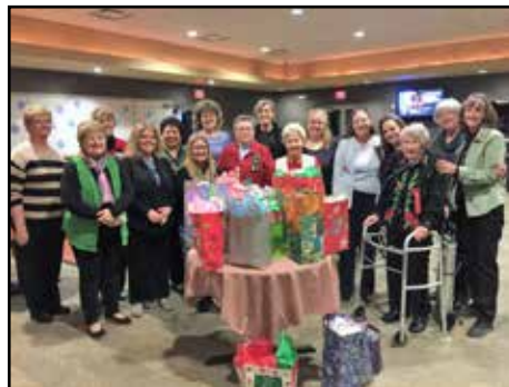
Kappa at the 19 th Hole