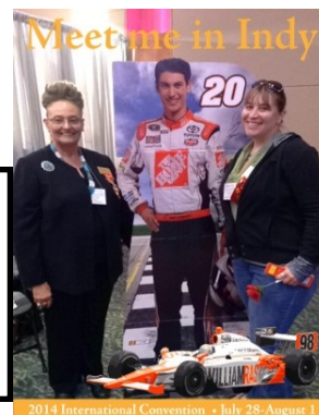
2014 International Convention • July 28-August 1