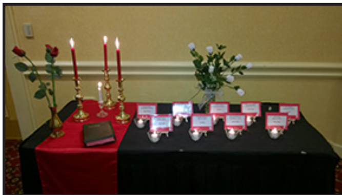
Table for Necrology service