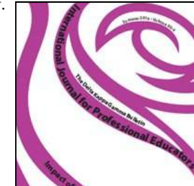
Read the Bulletin Online!

• Each member shall pay a World Fellowship Fee, annually.