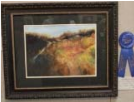
“Cap Rock” by Beverly Ellis