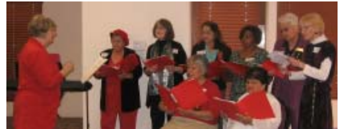
The CCC Choir entertains at the Birthday Luncheon.