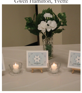
Table of Necrology Ceremony