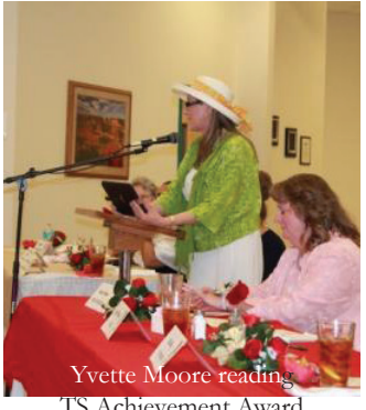
TS Achievement Award