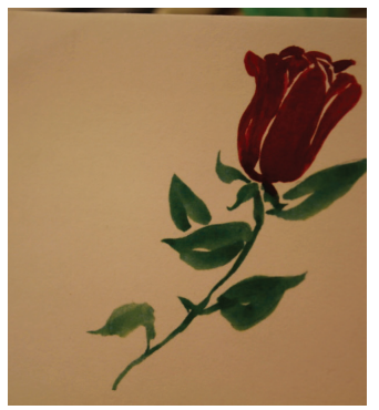
Hand painted placards