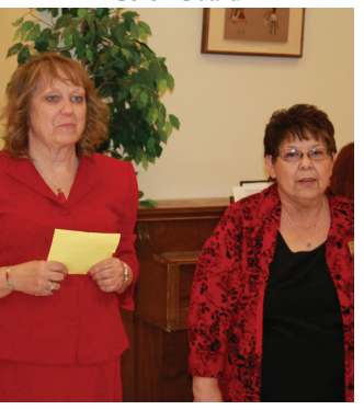
Upsilon - president installation