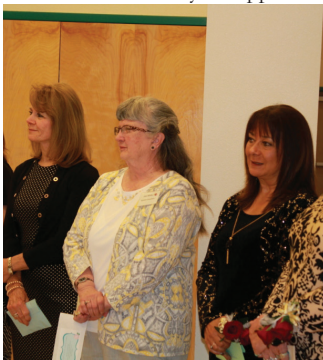
Presidents receiving instructions