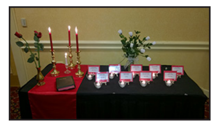
Table for Necrology service